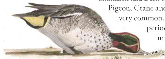
□ Common Teal

period more than one million birds pass through Rāpina polder.