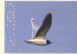
□ Little Gull

because it is easily confused with common Black-Headed Gull. Polder wetlands are also inhabited by colonies of close relatives of gulls – Black Terns. In Estonia Rāpina polder represents a crucial nesting place for both Black Tern and Little Gull.